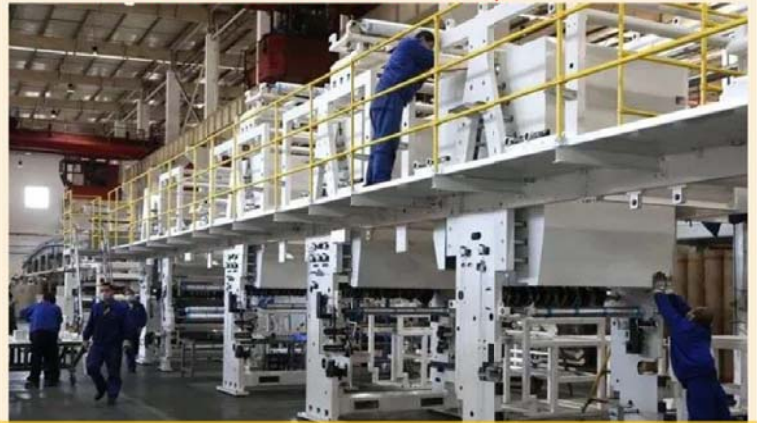
At Shaanxi Beiren's workshop

Thanks for all the customers care and support to SHAANXI BEIREN!!!