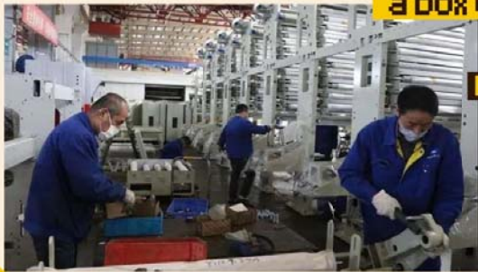
At Shaanxi Beiren workshop

Life is like a box of chocolate you will never know what you gonna get!