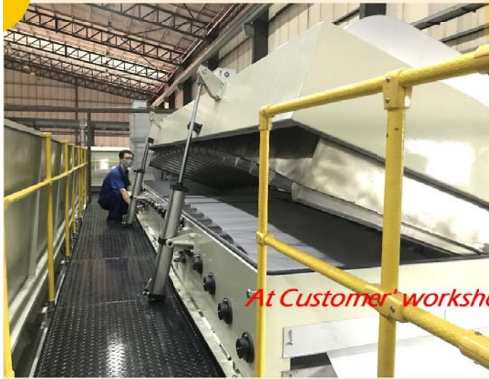
At Customer's workshop